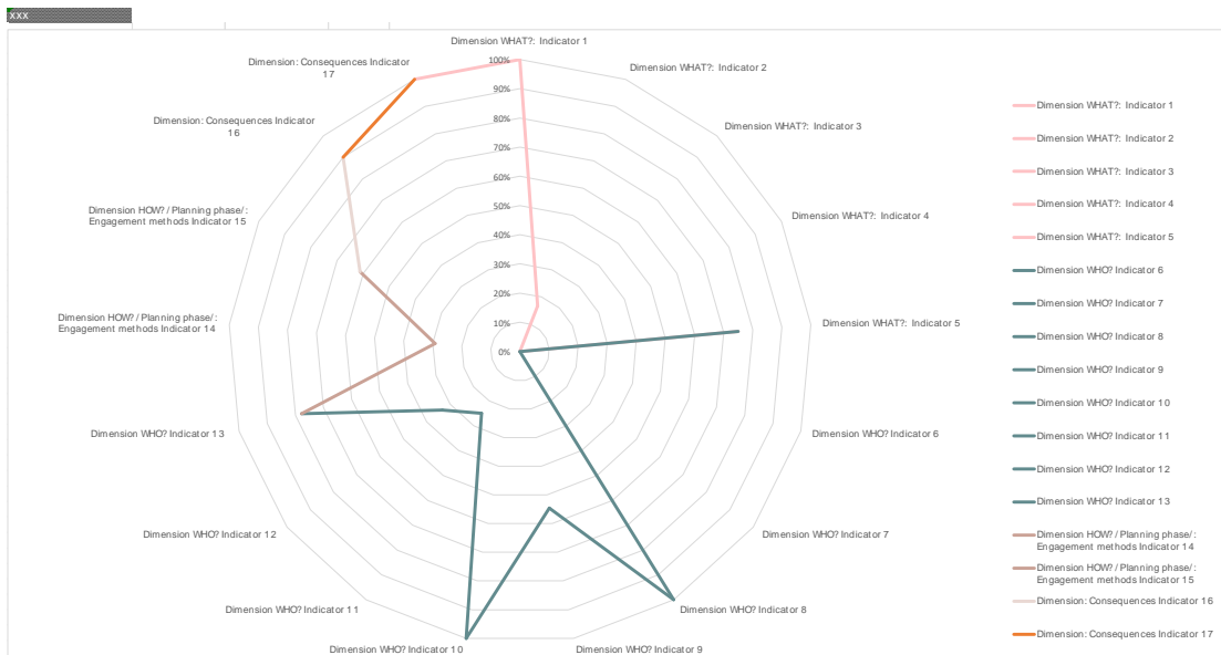
Figure 2: Illustration of Results Presentation within the STEP Index